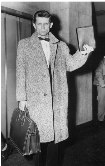
Dave Wilkerson arrives in New York City in 1958.

Wilkerson started out as a Pentecostal preacher in rural Pennsylvania.